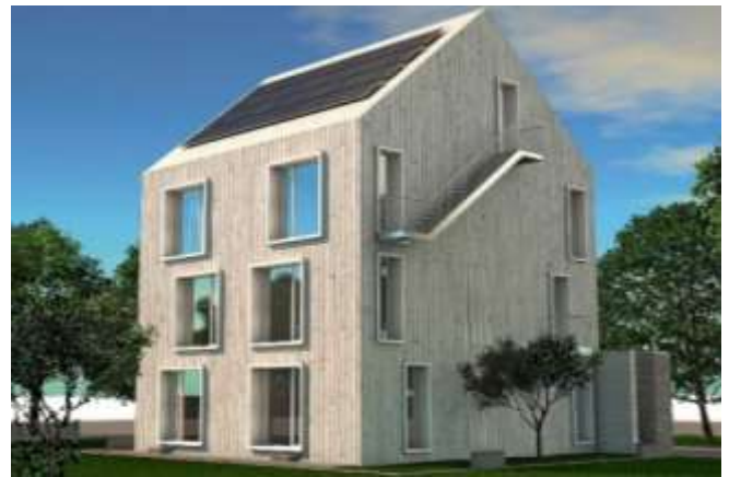
Generationenhaus Variante 2 © ah3

Generationenhaus Variante 2 © Eurobuild/ah3