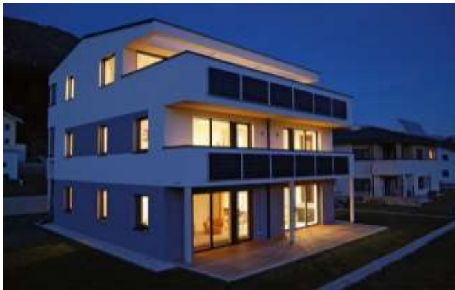
The first Generational building is located in Pusarnitz and was designed with an intelligent timber-frame construction and CLT.